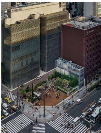
Ginza Sony Park