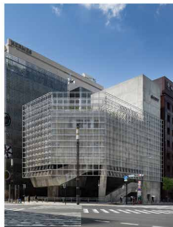
Ginza Sony Park